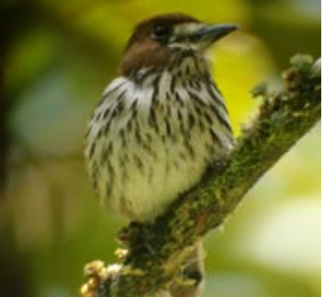
anceolated Monklet in the haga-Chemillen NP did its best to the photografers!