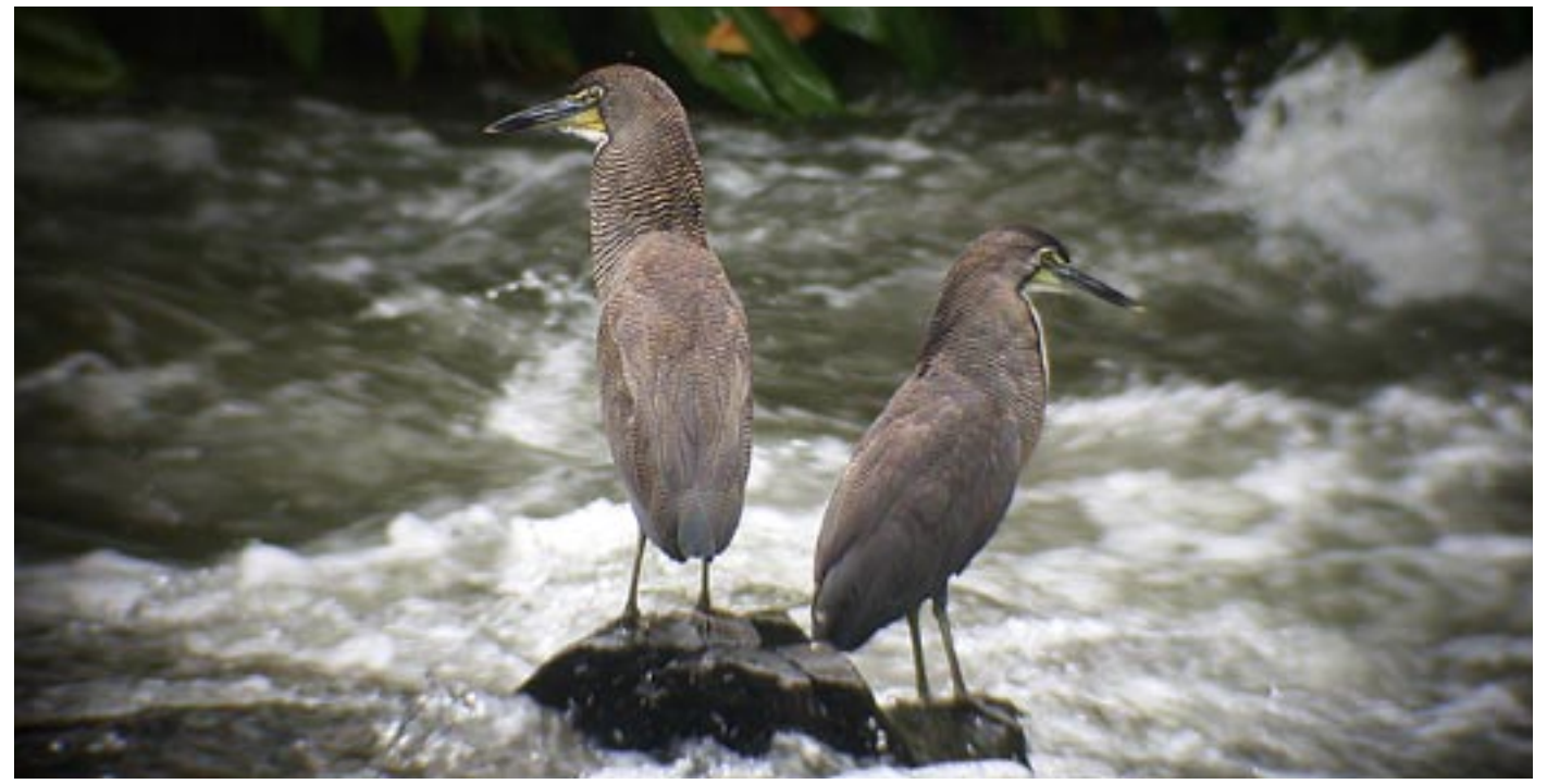
Fasciated Tiger-Herons in the river near Tingo Maria. We were lucky with this species on this trip with several sightings

Yellow-billed Teal Anas flavirostris 2 seen at Bosque Unchog, common at lake Junín Crested Duck Anas specularioides 10 seen at lake Junín Yellow-billed Pintail Anas georgica 25 seen at lake Junín, 6 seen between Apaya and Andamarca White-cheeked Pintail Anas bahamensis 25 seen at Pantanos de Ventanilla Puna Teal Anas puna 50 seen at lake Junín Cinnamon Teal Anas cyanoptera Common at Pantanos de Ventanilla Andean Duck Oxyura ferruginea 10 seen at Pantanos de Ventanilla, common at lake Junín Black Vulture Coragyps atratus Common in the lowlands Turkey Vulture Cathartes aura Common in the lowlands with singles up in the subtropics Andean Condor Vultur gryphus 2 ad+1 juv seen at Ticlio, 1 ad seen in the upper Santa Eulalia valley Swallow-tailed Kite Elanoides forficatus 1 seen at the Paty trail, 1 seen near Pozuzo, 5 seen between Ozapampa and Villa Rica, 1 seen on the Satipo road Pearl Kite Gampsonyx swainsonii 2 imm seen near Satipo Double-toothed Kite Harpagus bidentatus 1 ad with 2 juv seen at the Oilbird cave Plumbeous Kite Ictinia plumbea Singles seen in lowlands/foothills Cinereous Harrier Circus cinereus 1 female seen near Junín Plain-breasted Hawk Accipiter ventralis 1 ad seen on the Satipo road